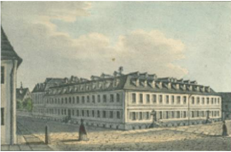
Image: View of the Widows' House in Herrnhut, where the General Synod met (Scholz/Gregor)

In the mid-19th century the Moravian Church faced a constitutional crisis that could well have ended the international Unitas Fratrum. While American Moravians were pushing for independence, others did not want to give up the centralised governance, based in Germany.